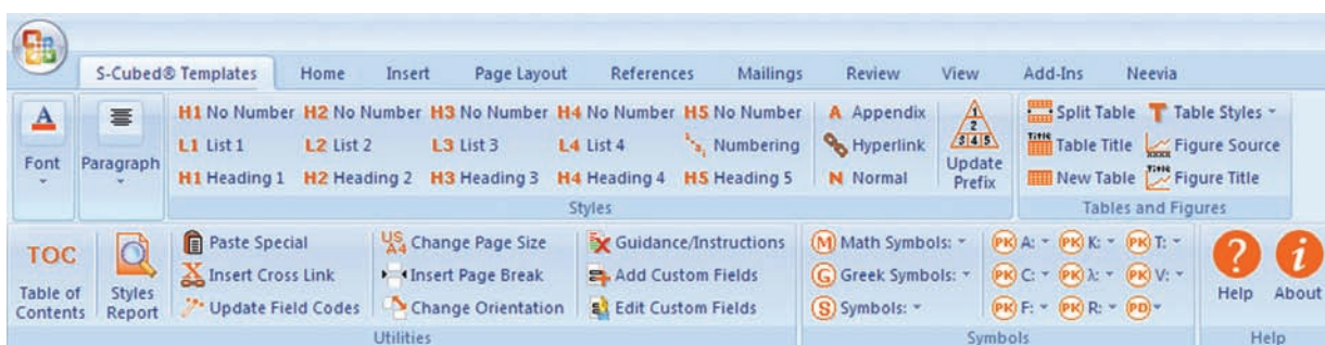
The S-Cubed Template Customized Tool Bars.

The S-Cubed Templates' customized toolbars support both Microsoft® Word® 2003 and Word® 2007. Complete with Word 2007 ribbon support, heading styles, numbered lists, table formatting, symbols, and many other features, the toolbars enable users to create well formatted documents at the touch of a button. In addition, the toolbars comply with industry guidelines helping ensure users work in accordance with their organization's standard operating procedures.